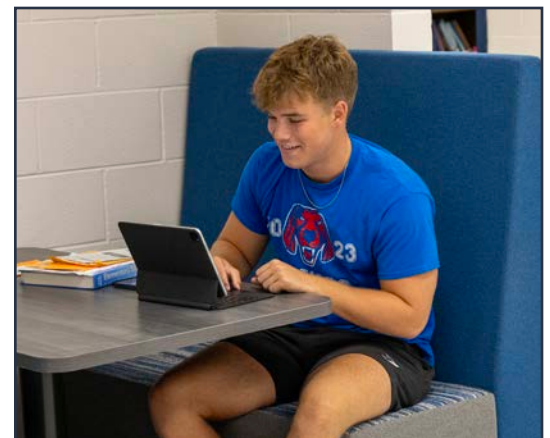
At left, OCC Ambassadors along with faculty and staff welcomed students to campus on Aug. 15-16. Above, students are utilizing the lounge outside the library for breaks between classes.