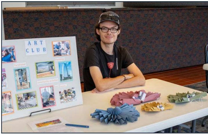
The Art Club was among several campus organizations that participated in OCC's Club Rush on Aug. 27.