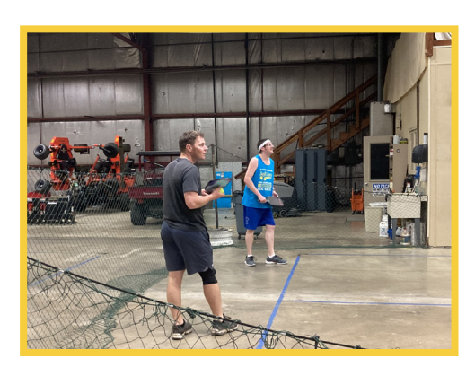
A high-intensity pickleball game in the WDC