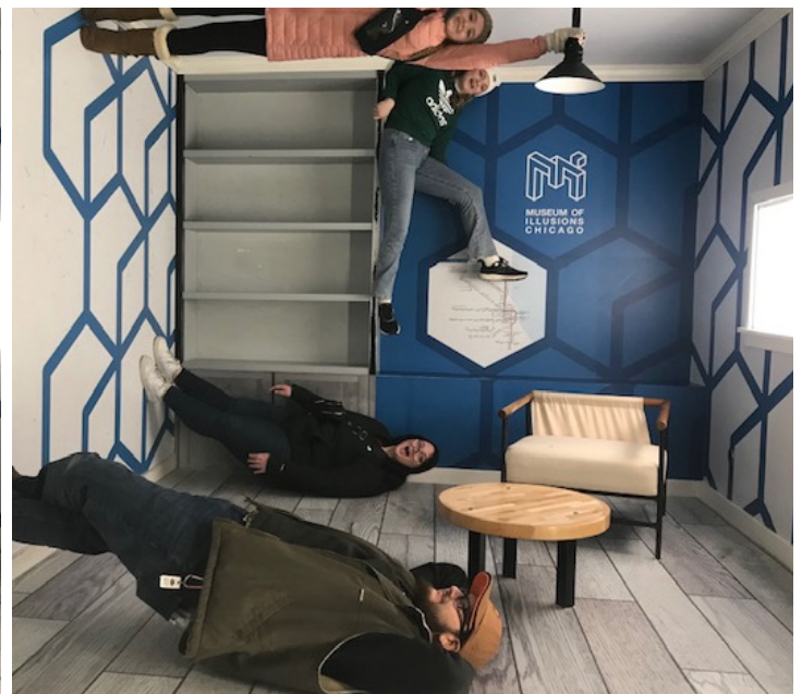
Members of the group in a topsy-turvy room at the Museum of Illusions.