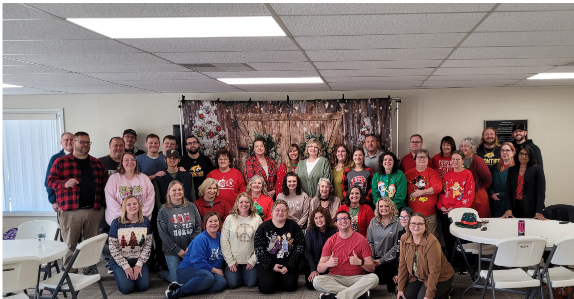
FCC Christmas Party 2024