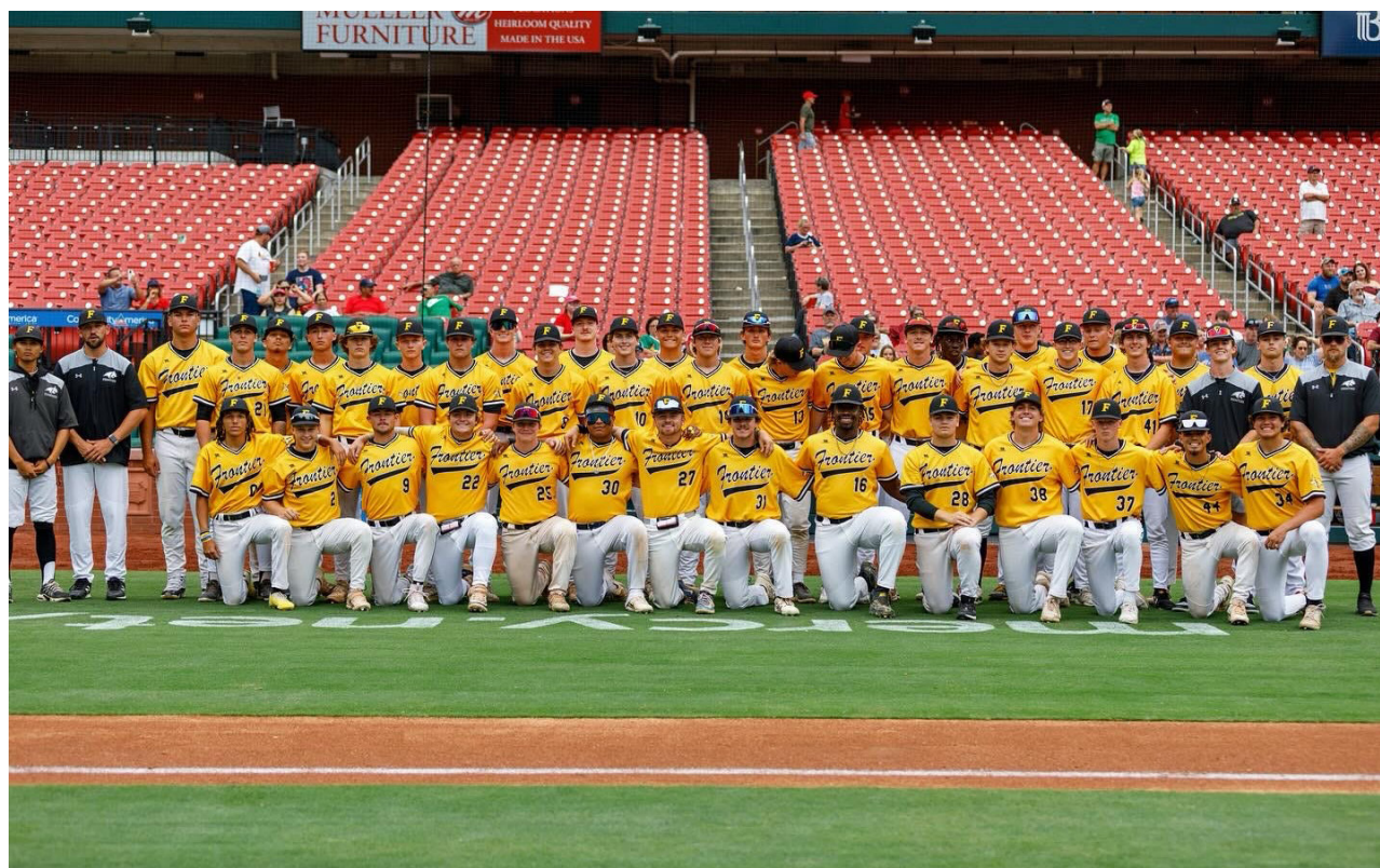
Bobcats Baseball team photo at Busch Stadium in St. Louis, MO.