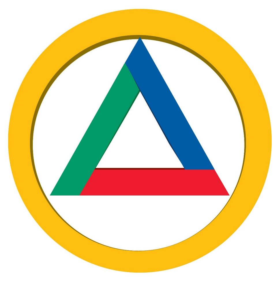
Illinois Eastern Community Colleges Student Code of Conduct 2019