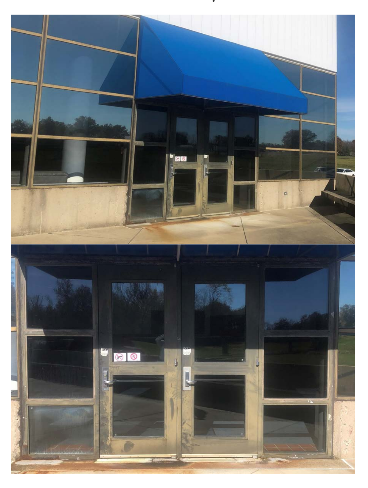
Opening #1 - Existing Wattleworth Hall Student Union (south face) East Opening Assembly