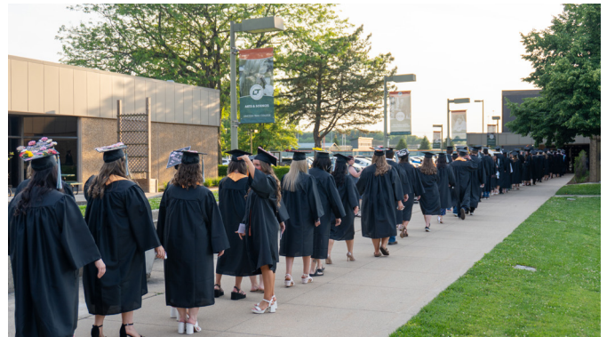
Students march to the Sports Center in the Processional for LTC graduation ceremony.