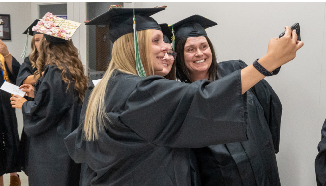
Students gather to take a selfie as they prepare for Lincoln Trail College's graduation ceremony.