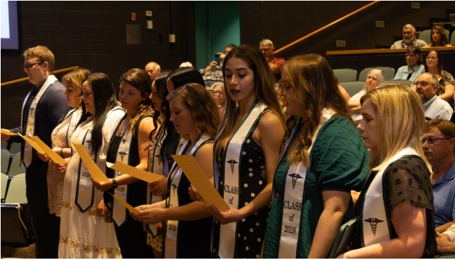
Graduates of the Nursing Program read the Nightingale Oath at Lincoln Trail College's Nursing Pinning Ceremony.