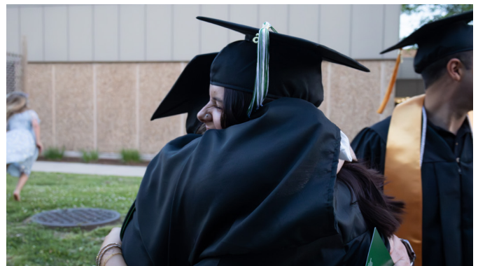
A Lincoln Trail College student celebrates outside of the Sports Center following LTC's graduation ceremony.