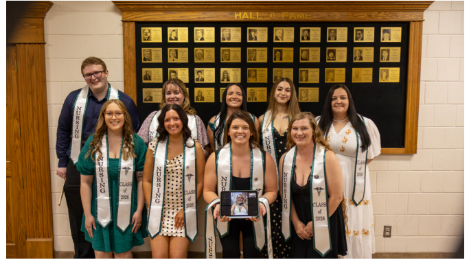
Nursing Program graduates pose for a group picture after their Pinning Ceremony.