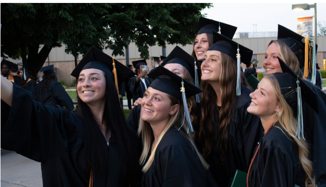
Say cheese! Members of LTC's softball team pose for a selfie following LTC's graduation ceremony.