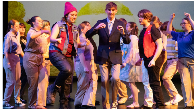
Cast members light up the stage with a spirited musical performance in Descendants .