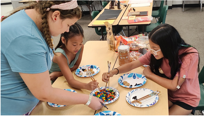
Students put their chopstick skills to the test during a hands-on activity at Lincoln Trail College's Mandarin Chinese camp.