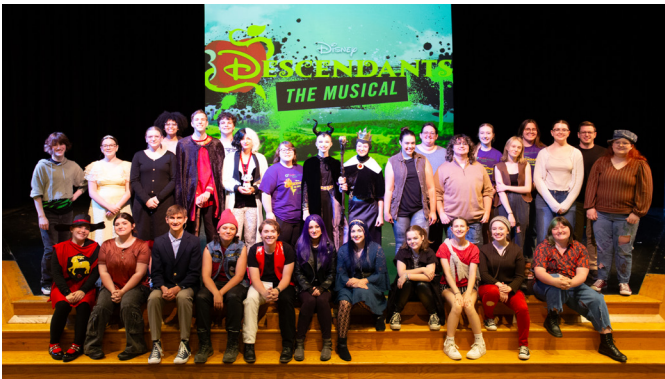
The talented cast and crew behind LTC's Young Adults Theater production of Descendants: The Musical .