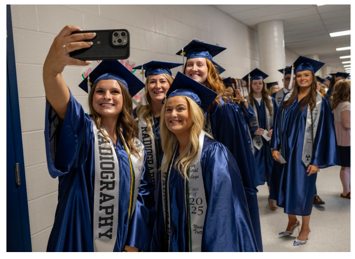
With smiles and selfies, Radiography grads get ready to mark a major milestone.