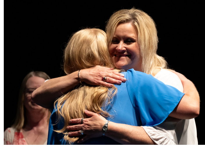
A heartfelt hug marks a proud milestone during OCC's Nursing Pinning Ceremony.