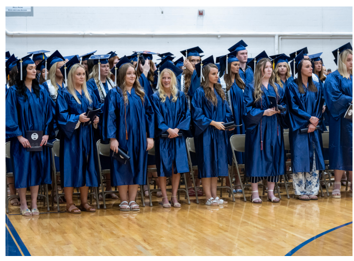
Graduates from Olney Central College's Class of 2025 stand to be recognized during the Commencement Ceremony.