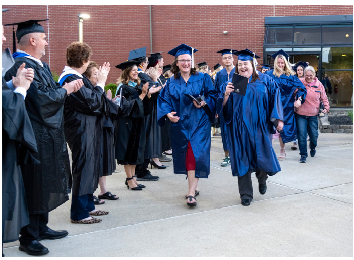
A round of applause greets graduates as they exit the ceremony and head into their next chapter.