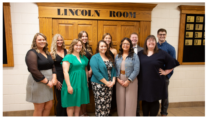
The LTC Nursing Class of 2025 smiles for a group photo ahead of their special pinning ceremony.