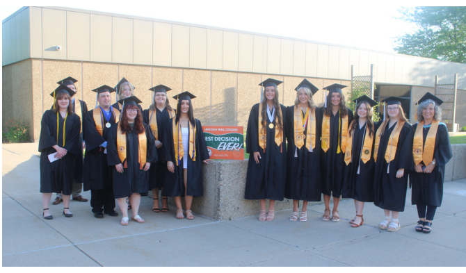
Members of Phi Theta Kappa pose proudly before Lincoln Trail College's 55th Annual Commencement.