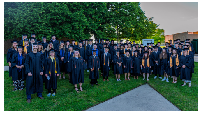
Graduates from the Class of 2025 smile for a group photo before the 55th Annual Commencement at LTC.