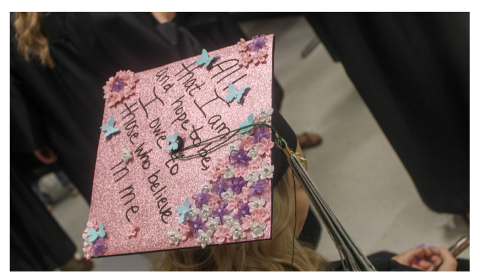
All that she is—and hopes to be—this LTC grad says thanks with a cap full of sparkle and sentiment.