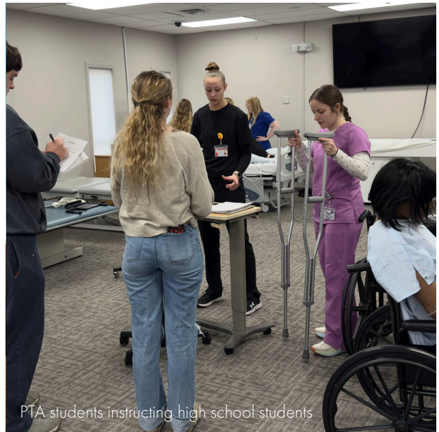
PTA students instructing high school students