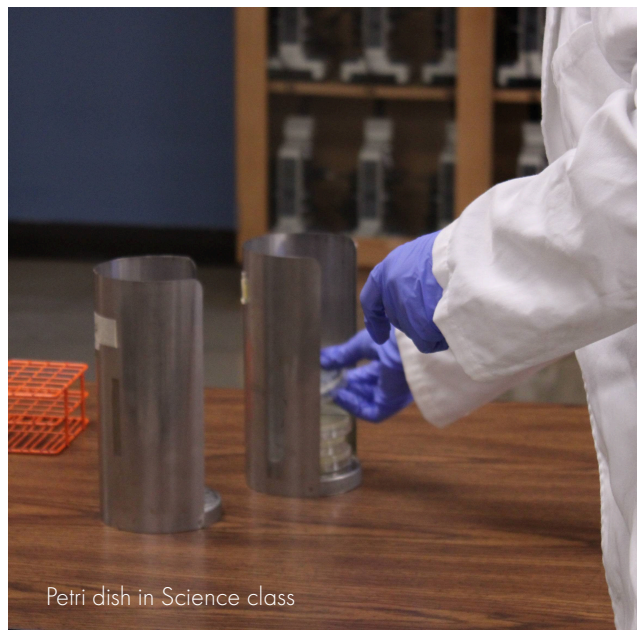
Petri dish in Science class