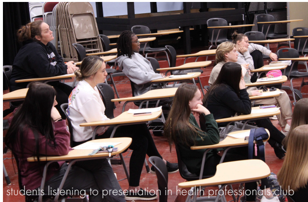
students listening to presentation in health professionals club

IECC is celebrating Career and Technical Education Month, and WVC is excited to showcase our programs. Check out these photos of Wabash Valley College students actively engaging and learning in various fields. 🔥