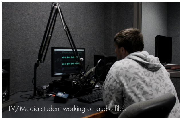
TV/Media student working on audio files