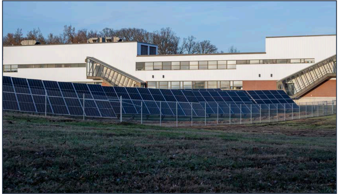
At right, installation of the 622 solar panels began in September. Above, the completed solar array, which is located on the southeast corner of Dr. Kent L. Wattleworth Hall.

The project underscores OCC's commitment to sustainability and minimizing its ecological footprint.