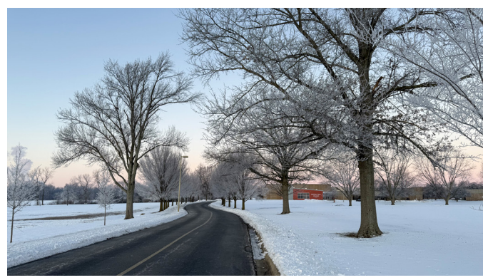
Winter's quiet magic blankets the path to Lincoln Trail College. Frost-kissed trees, crisp air, and a sky painted in pastels helped start a new day in January.