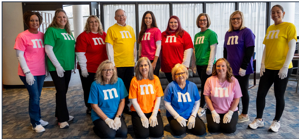
Best Group Costume: Student Services M&Ms