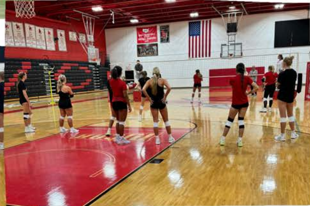
Volleyball team practicing for the upcoming season.

With the Olympic Games having recently concluded, the excitement of athletics is far from over—now it's time to focus on WVC's fall sports! As the world's greatest athletes return home, our very own Warriors are gearing up for their upcoming seasons. Both the Soccer and Volleyball teams at WVC have been hard at work, practicing for weeks to prepare for the challenges ahead.