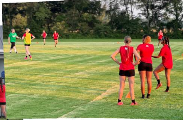
Soccer team playing a scrimmage game.