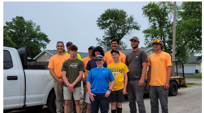
Students participating in LTC's Explore a Broadband Career pose with Connexus employees.