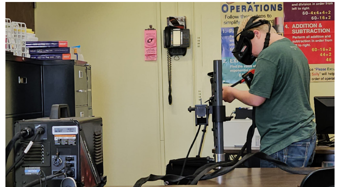
Students participating in Explore a Welding Career had a chance to try LTC's virtual welder and visit SENCO Construction.