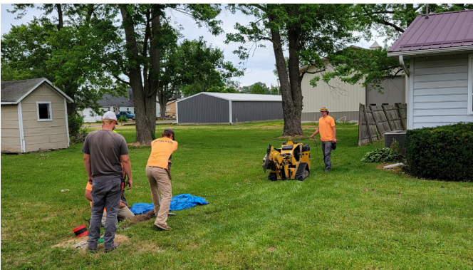
Students had a chance to visit a fiber to the home project during LTC's Explore a Broadband Career event.