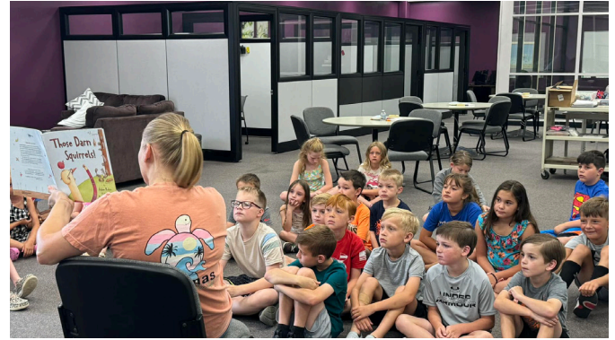
Students participating in College for Kids take some time to read a story.