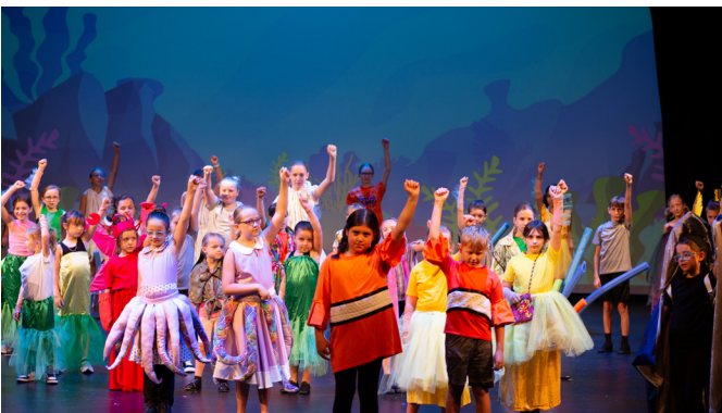
Children's Summer Theater went for an underwater adventure with a production of Disney and Pixar's Finding Nemo KIDS.