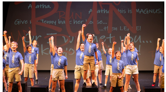
Children's Summer Theater had a spellbinding performance of Roald Dahl's Matilda The Musical JR.