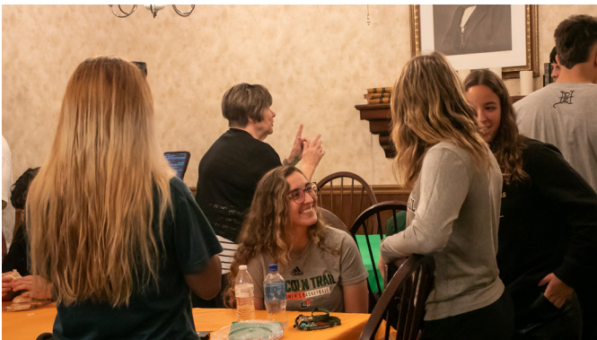
International students spend time with friends, staff and instructors at the annual LTC International End of Year party.