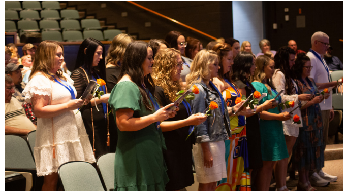
Lincoln Trail College Class of '24 nursing students recite the Nightingale Pledge during their pinning ceremony.