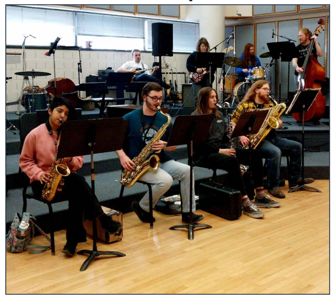
Members of the OCC Big Band rehearse a number for their Spring Concert on April 24.

The OCC Brass Band, under the direction of OCC Director of