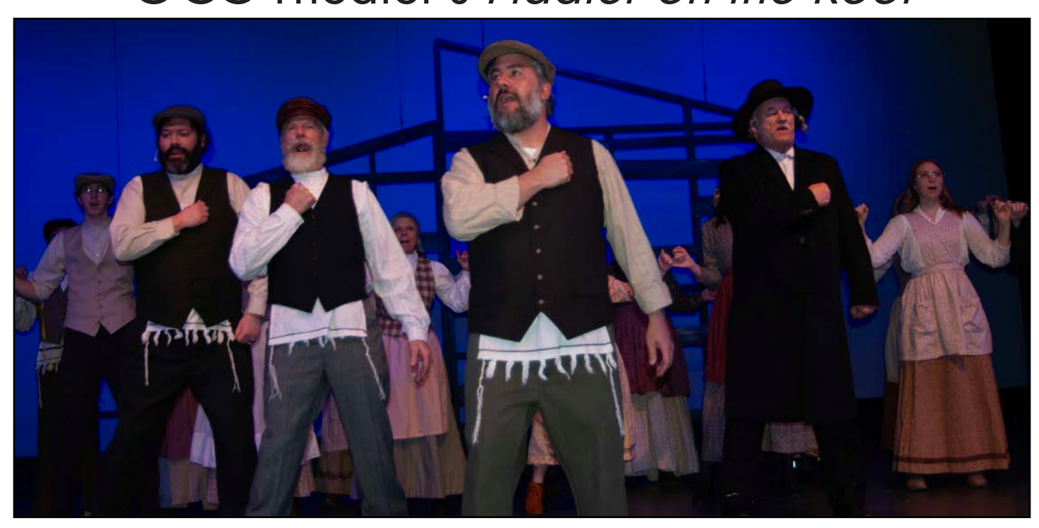
The OCC Theater presented Fiddler on The Roof March 15-17 and March 21-24.