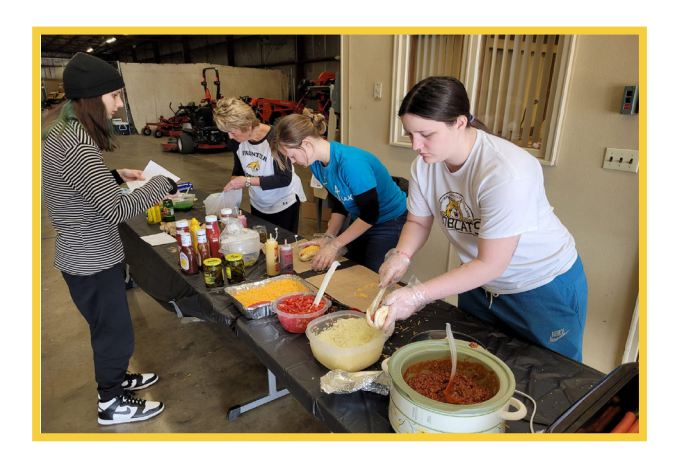
Cultural Diversity students selling 'Chicago dogs' to fund a future class trip

Additionally, the class will be hosting a 'Cultural Cookie Extravaganza' on Wednesday, December 6th, in Mason Hall. The class will be handing out Christmas cookies from around the world for anyone that stops by, free of charge.