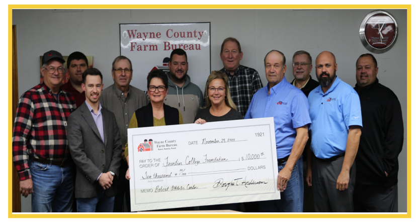
Wayne County Farm Bureau presenting a donation to the FCC Foundation for the future athletic center on campus