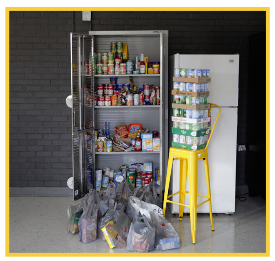
Total collection of donations from the FCC campus

The IECC Annual Food Drive includes all four IECC colleges and took place from November 1st through November 30th. The drive is always a friendly competition between campuses as they look to collect as many donations as possible to benefit our campuses and local communities.