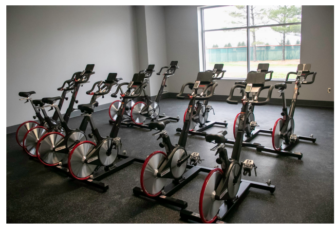
Spin bikes fill one of the CCRC's three fitness studio

member, you will have an opportunity to set and achieve fitness goals, form relationships, have fun, and make memories that will last a lifetime.