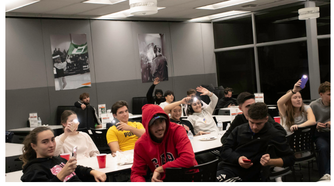
LTC students light up their phones while grooving to the music during Student Senate's Pancake and Karaoke Night.