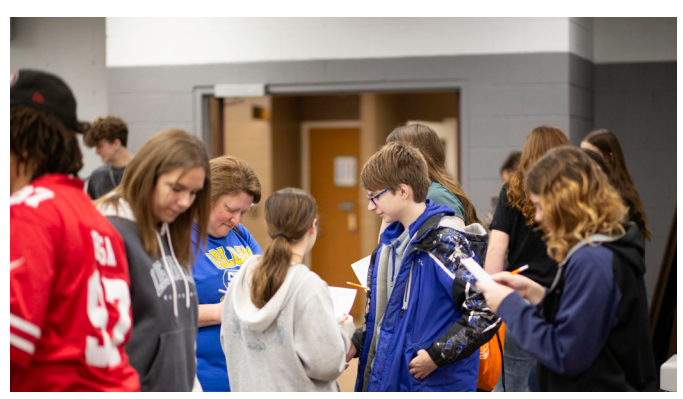
Students start searching for ways to earn a Bingo during LTC's Future Statesmen Day.