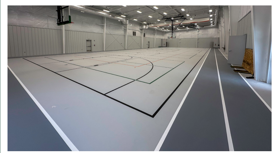
The gymnasium in the CCRC is surrounded by an indoor walking track and features multipurpose sport courts.

The Crawford County Recreation Center will offer monthly and annual membership rates. There are membership types for students, individuals, families, and seniors ages 65 and up. There is a pool pass and a pickleball pass available for people who plan to only use that part of the CCRC. The facility is opening to the public on December 18.