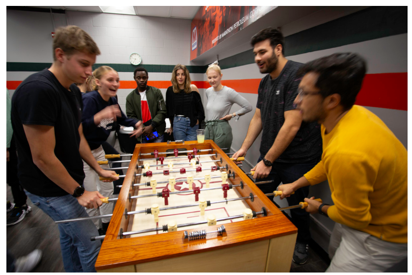
International students bond over an intense game of Foosball in LTC's Student Lounge

This year's International Thanksgiving Meal also fell on International Students Day. The annual day recognizes the contributions of international students to education.