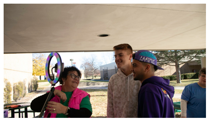
Two students get instructions on how to take a 360 photo during LTC Statesmen Day.