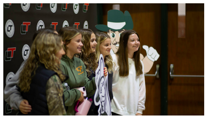
A group of students pose for a picture during LTC's Future Statesmen Day.