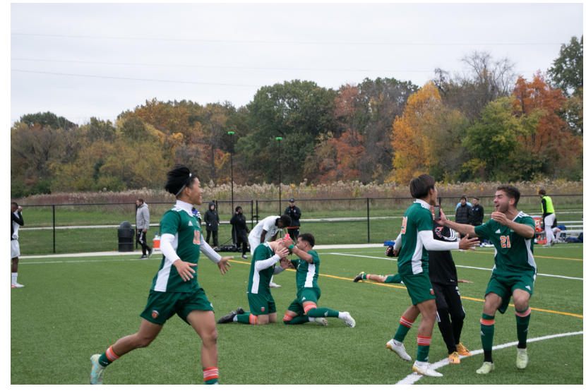
The Statesmen celebrate after the final whistle in the Region 24 Championship Game

LTC played Lewis & Clark Community College in the Region 24 Championship game. After splitting games during the regular season, the Statesmen claimed