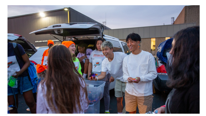
LTC students hand out candy and other toys during Trunk or Treat at the Trail. More than 2,000 people from the community attended the event.