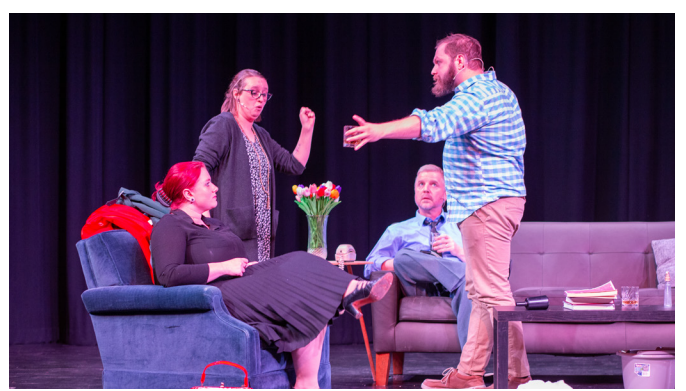
Two couples argue during a production of Lincoln Trail College's God of Carnage