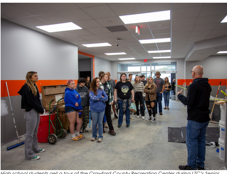
High school students get a tour of the Crawford County Recreation Center during LTC's Senior

As I pull into the LTC campus each morning, I am reminded of and thankful for the incredible opportunities that we all have on a daily basis to make a difference in the lives of our students, both inside and outside of the classrooms. The new developments and growth initiatives are creating an invigorating environment. The Crawford County Recreation Center is not just a new facility; it's a hub for community engagement, wellness, student life, and shared experiences. Breaking ground on the new Athletic Training Facility will be a testament to our dedication to excellence in athletics and the well-being of our student-athletes. The Broadband Telecom program, which continues to take root here on our main campus, is an exciting addition that reflects our responsiveness to ensure learning and optimal student outcomes. The triangle picnic area will soon be home to the Illinois Green Energy Network solar powered charging station tables that I can picture in my mind already. And then, there's the reality of the Technology Center that is just over the horizon, and as it comes closer to existence, we can anticipate a space that will foster innovation, collaboration, technological advancements, and the pursuit of knowledge. Six new Frontier Elm trees were just planted along the south side of the main entrance, thanks to our generous LTC Foundation and Operations & Maintenance crew, and let's not forget about that beautiful sidewalk that now connects the greenhouse driveway to the