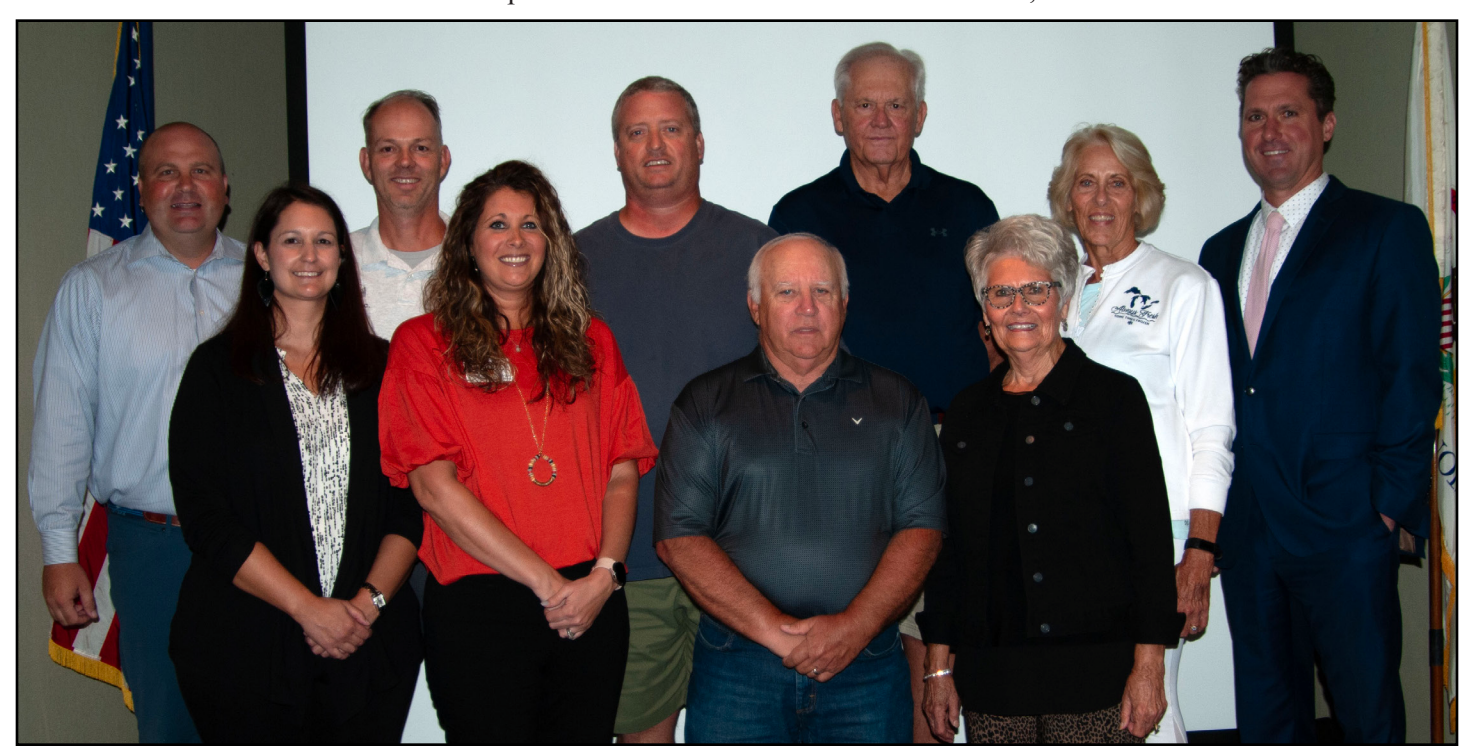
OCC Foundation assists with 60th Anniversary Celebration

For more information or to register, call 395-7777.