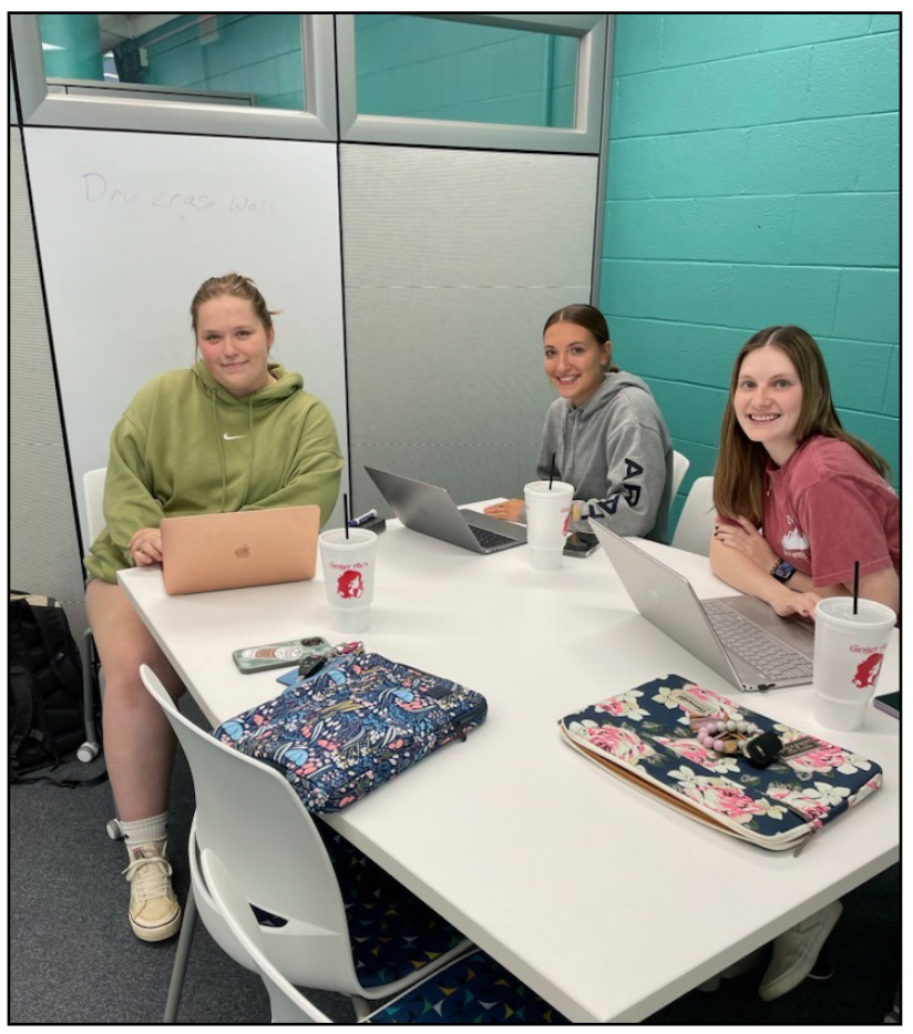
First-year nursing students are among those using the new study rooms in the Anderson Library.