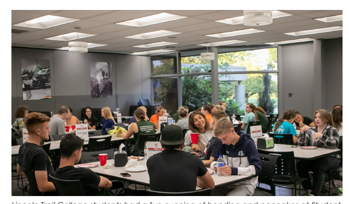
\label{lincoln} \textit{Irail College students} \ \textit{had a fun evening of bonding and pancakes at Student Senate's Pancake Night.}