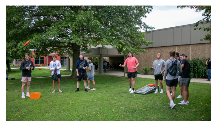
A group of students gather to play a game of corn hole during Lincoln Trail College's Welcome Back Blast.