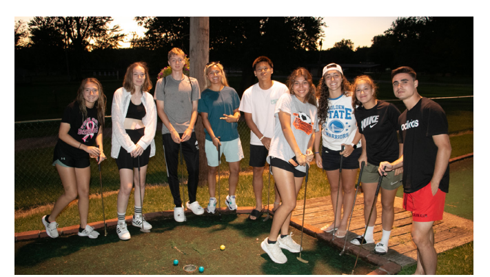
Student-athletes had the opportunity to bond with each other with an event at the Robinson City Park.