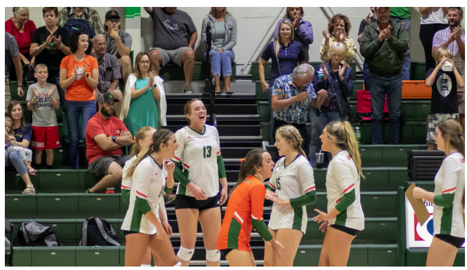
Lady Statesmen volleyball players celebrate a five-set win over Rend Lake College.