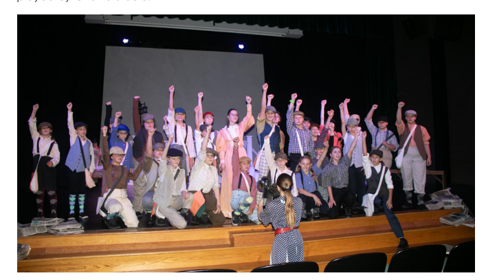
The Newsies pose for a picture in LTC's Children's Summer Theater production of Disney's Newsies, {\it Jr.}