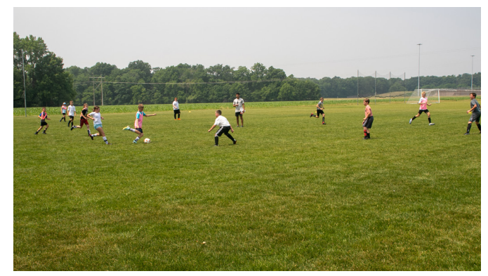
Students in LTC's Youth Soccer Camp put the skills they've learned to a test by playing a game at Statesmen Park.