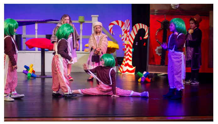
Oompa Loopas complete a dance during LTC's Children's Summer Theater production of Roald Dahl's Willy Wonka, Kids.