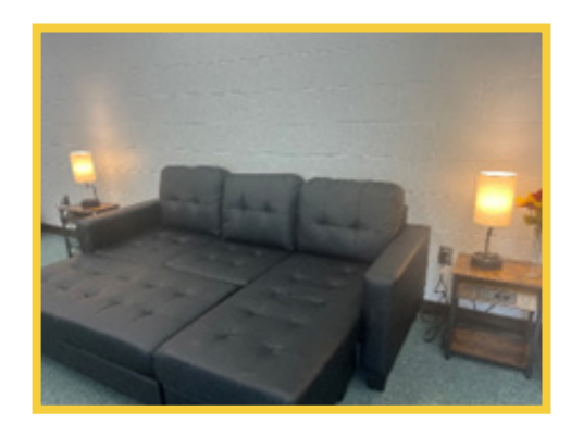
New, relaxing furniture in the student lounge