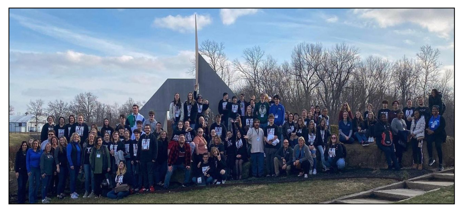
IECC hosted 145 TRIO students and graduates who participated in the 2023 National TRIO Day of Service on Feb. 25.