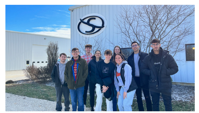
Lincoln Trail College FBLA-C students got the opportunity to tour Flying $ and learn more about their operations.