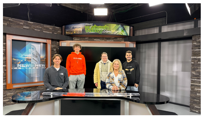
Student Publications students had the opportunity to tour WTWO/WAWV to learn about broadcast journalism.