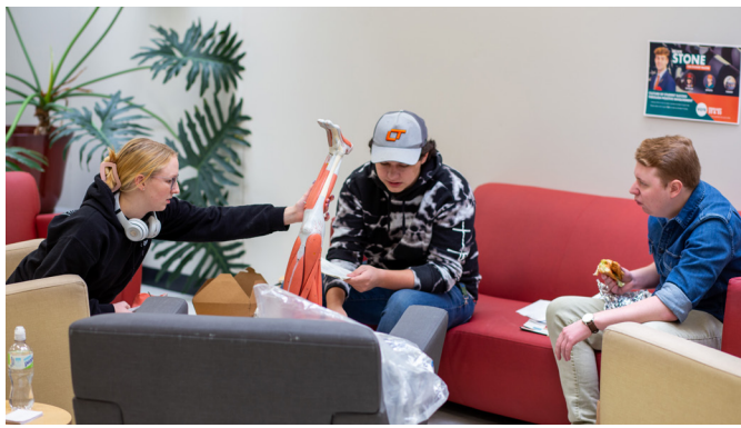
Anatomy students don't skip leg day. The students studied the anatomy of a leg over lunch.