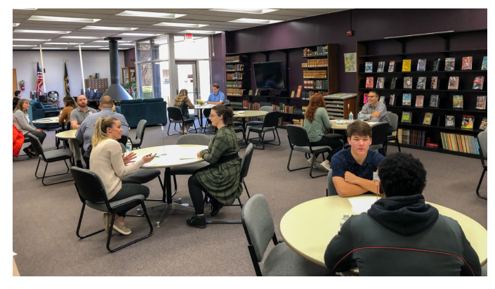
Introduction to Teaching students participate in mock interviews with staff members to help them prepare for real interviews for teaching positions.