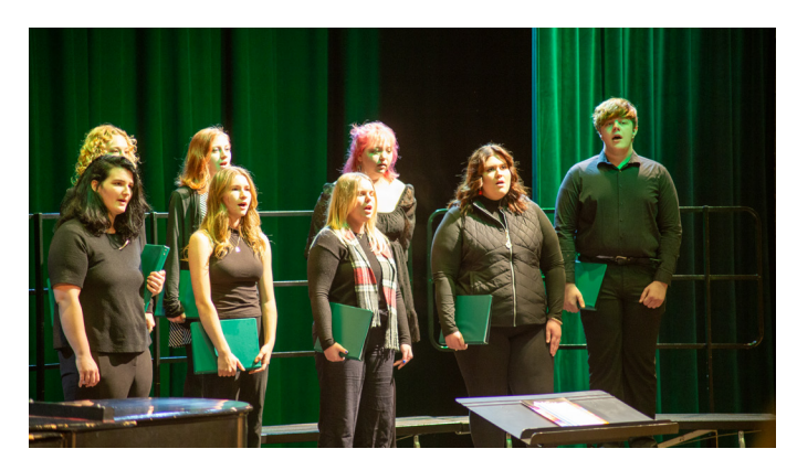
The Lincoln Trail College Statesmen Singers perform "Omnia Vincit Amor" a cappella style during the Winter Concert.