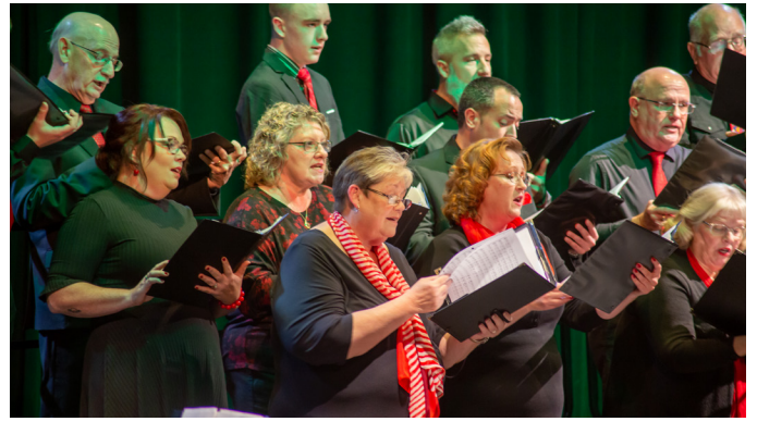
Members of the Lincoln Trail College Concert Choir perform during the Winter Concert.