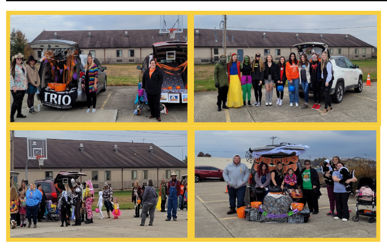
Some FCC students, staff, and visitors during trunk or treat