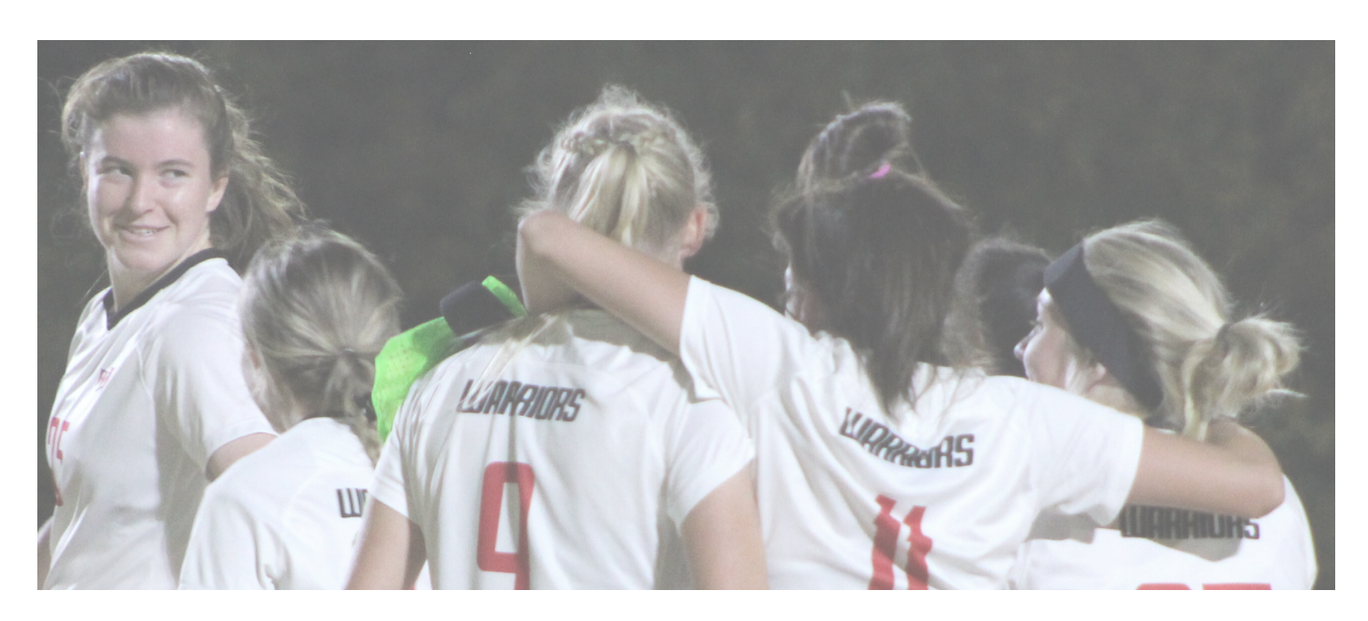
WABASH VALLEY COLLEGE