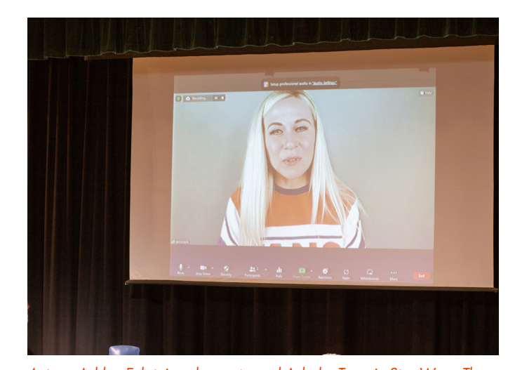
Actress Ashley Eckstein, who portrayed Ashoka Tano in Star Wars: The Clone Wars, speaks to students at the Young Women Lead Conference.