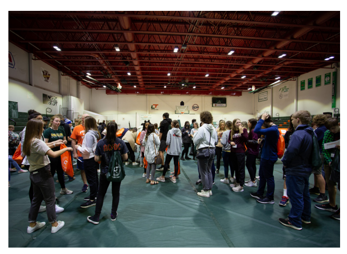
About 200 high school seniors from the area visited Lincoln Trail College for Senior Blitz '22. They learned about LTC and college life in general.