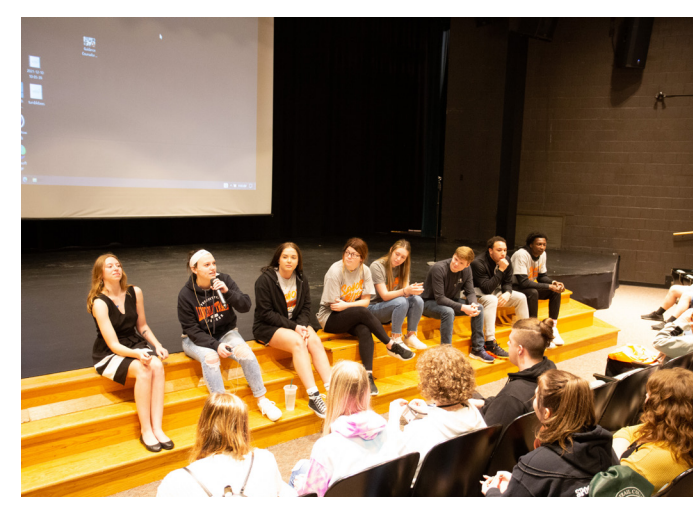
LTC students talk with high school students at Senior Blitz. They shared their stories about why they chose LTC and offered advice to the students.