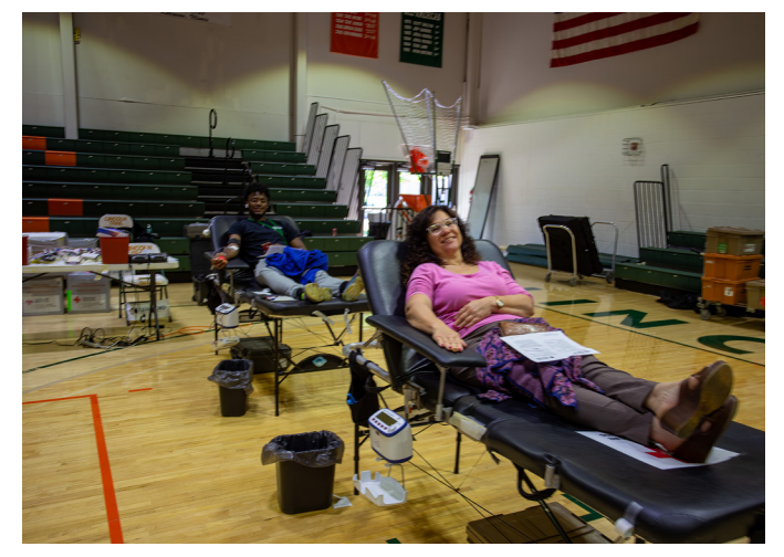
Lincoln Trail College hosted a Red Cross Blood Drive in April.