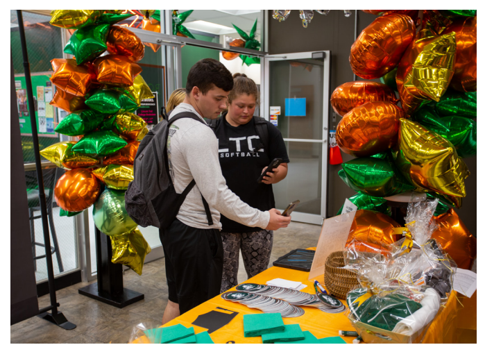
LTC students check in at Grad Fest before receiving their caps and gowns and other giveaways.