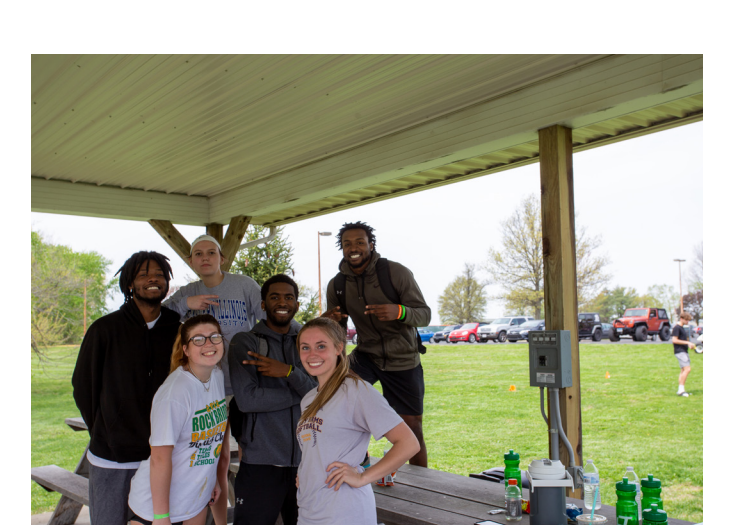
A group of Lincoln Trail College students enjoys Craze Daze, which featured numerous games, giveaways, and food.