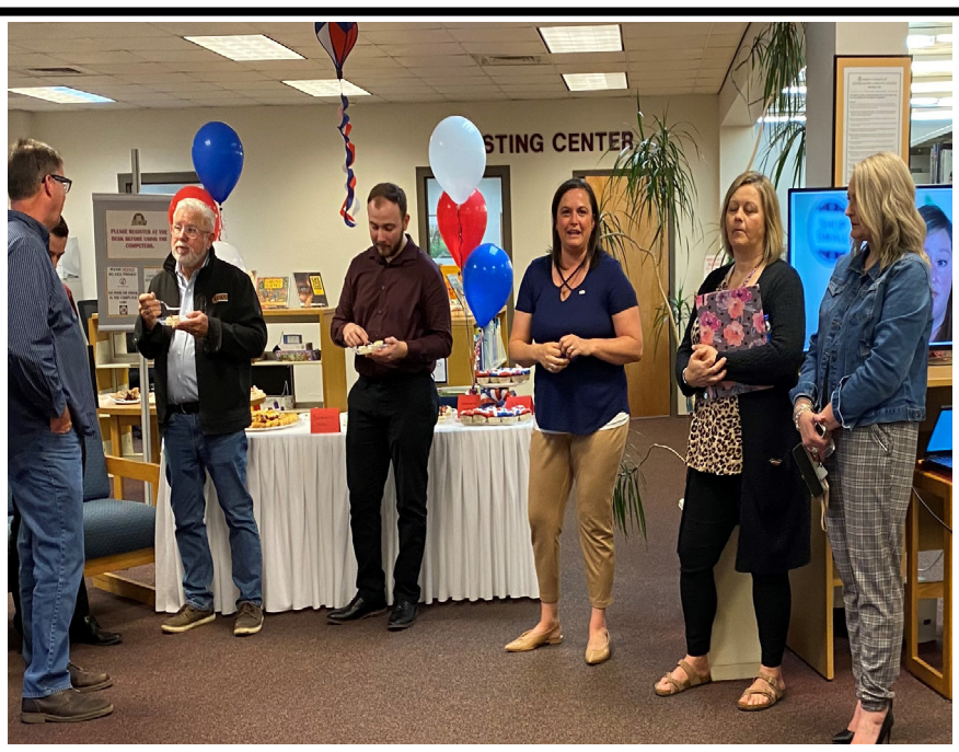
SBDC open house attendees

Guests enjoyed networking and light refreshments and received handouts with SBDC information. Additionally, several existing and emerging businesses made appointments to return for services. The open house was hosted in Elizabeth C. Cox Hall, where the SBDC office is located.