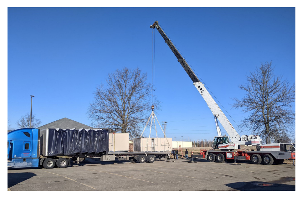
Crane unloading new Mammoth HVAC Unit

If you visited FCC's campus early in March, you might have noticed a crane on campus. This towering presence was not there to construct a new highrise. Instead, it was to install two new Mammoth HVAC units, one for Cox Hall and one for Mason Hall. These units are massive, together they filled an entire full-sized semi-truck bed and each unit weighed in at over 8,500 LBS. Installation went smoothly with only minor hiccups. Both buildings' new HVAC systems are now fully installed and ready to go for the upcoming summer heat.