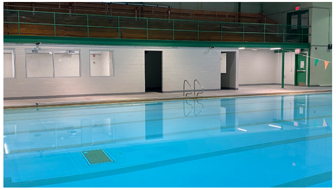
Work continues on the Rowland-Nicholas Natatorium.