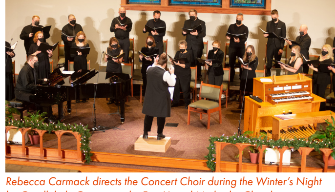
by Candlelight Concert at the First United Methodist Church.