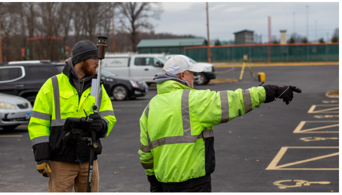
Surveying begins for the Crawford County Recreation Center.