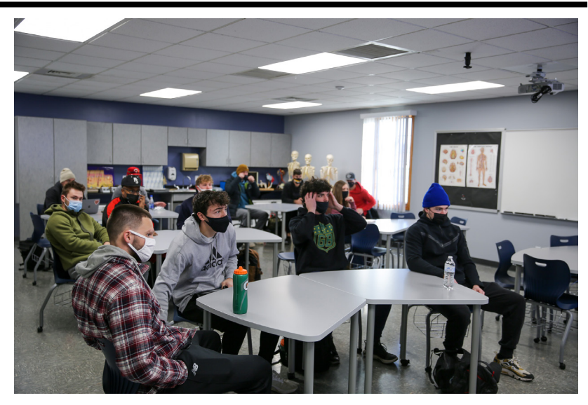
Students in the recently finished Mason Hall room 23