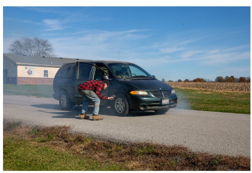
Student using heat vision camera to measure brake pads

The brutal use of the brakes resulted in soaring brake pad temperatures and dramatic increases in stopping distances. After each run, the students measured the stopping distance and used a heat vision camera to detect the temperature increase. As the temperature climbed, the stopping distance rose.