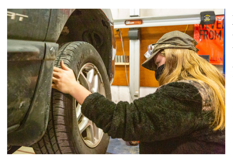
Student removing tire to access brake pads

After ten runs with one set of brake pads, the students would use their shop experience to switch out the brakes for a new set. This costly lab was made possible by a generous donation from local auto parts store ADA, who donated three sets of brakes, one at each of their tiers of quality.