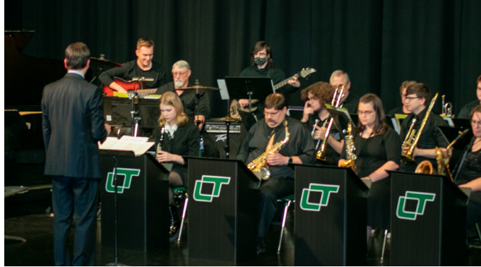
The Lincoln Trail College Jazz Band prepares to perform during LTC's Fall Concert.