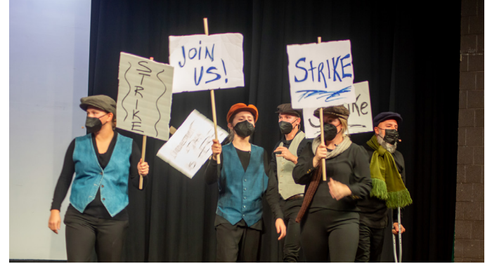
Members of the cast of All Together Now! perform "Seize the Day" from Disney's Newsies.