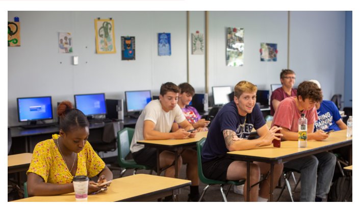
Students prepare for the first day of classes on August 17.