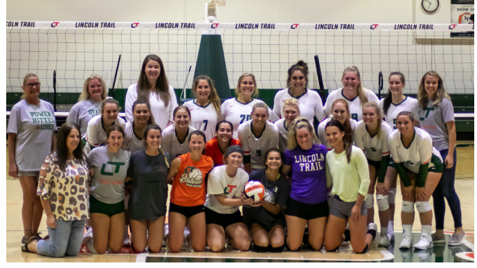
Lincoln Trail College volleyball alumnae returned to the Sports Center to face the current volleyball team in the annual Alumni Game.