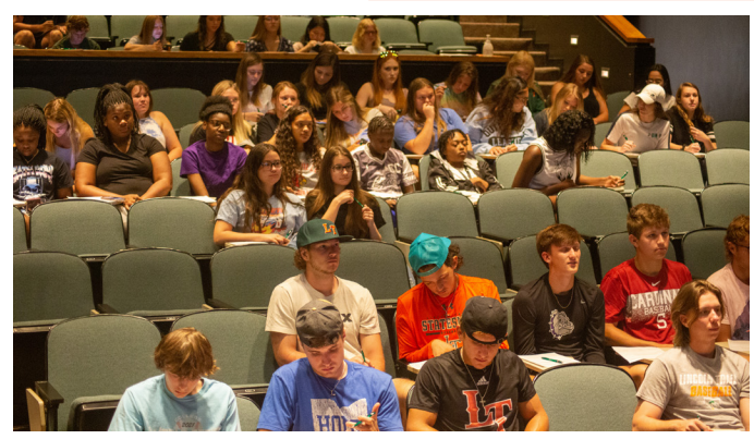
Students gather in the Zwermann Arts Center Theater for New Student Orientation.