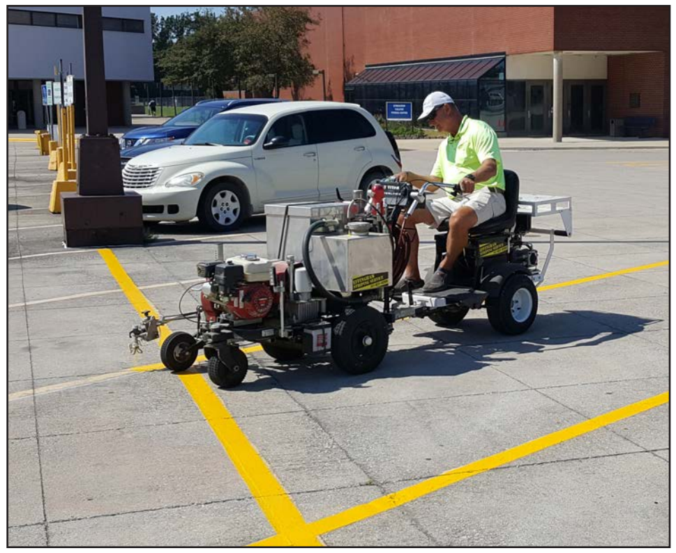
Above, the North and Banquet Room parking lots were painted earlier this month. At top, a new structure was built to provide shade for the Cozy Corner Playground.

constructed to provide shade for the children.