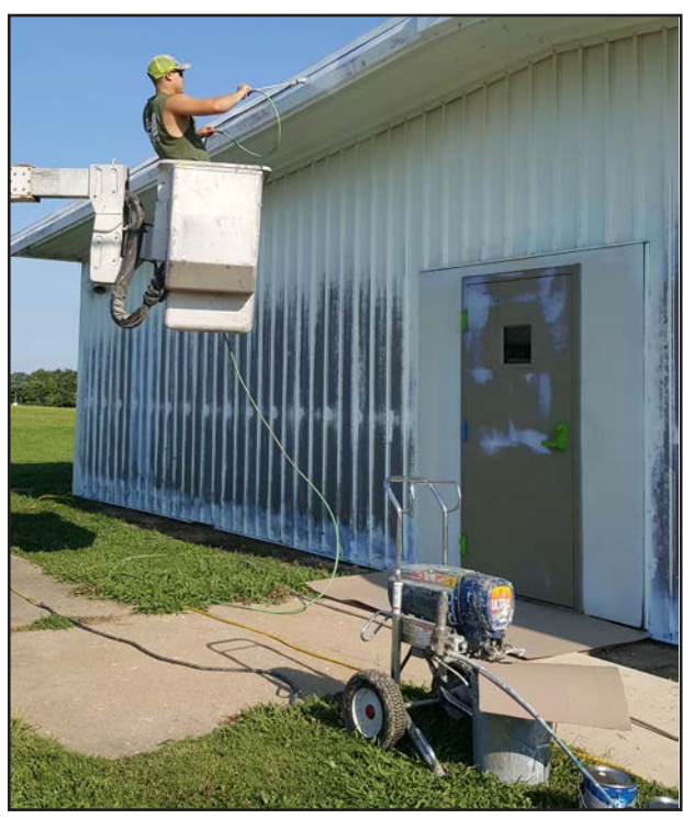
Improvement projects completed this summer include cement work in the parking lot outside the Banquet Room and painting of bor-intensive job as the existing material the former Auto Body Building.

Work also is underway in the Student Union to apply new tinting to the windows facing the patio area. It's a la-