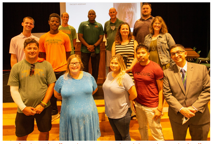
New faculty and staff members were introduced during the Faculty/Staff Workshop.

LTC worked with dual credit students as well. Once again, the College offered a Dual Credit Orientation for those students and their parents or guardians. The event was Workshop . designed to help dual credit students prepare for college-