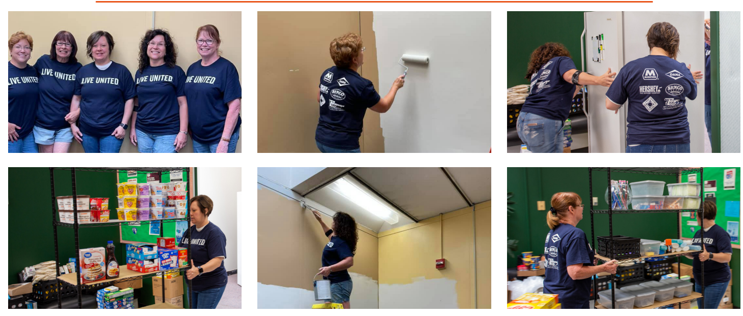
Volunteers with the United Way of Crawford County came to Lincoln Trail College on July 23 for a Day of Caring event. The repainted the LTCares Food Pantry and helped reorganize it. The Day of Caring brings together energetic volunteers to help community organizations throughout Crawford County with projects that they might not otherwise be able to complete.

The deadline for students to apply for the Educational Paycheck is August 31. All four colleges in the District have been using social media, digital advertising, and signage on campus to help spread the word about the program. Financial Aid officers have also been reaching out to students directly to make them aware of the program.