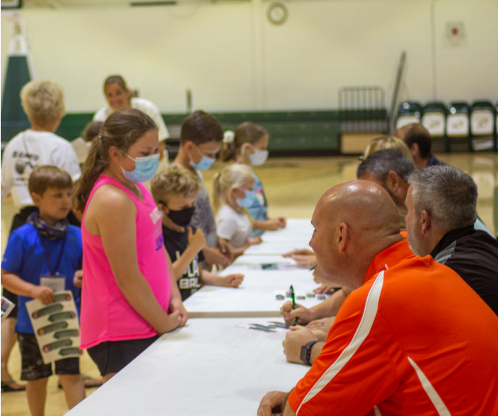
Lincoln Trail College coaches sign autographs for eager students in the College For Kids program.