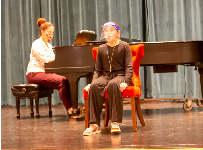
Spring youth recitals gave kids a chance to perform the music they worked on during the spring semester.