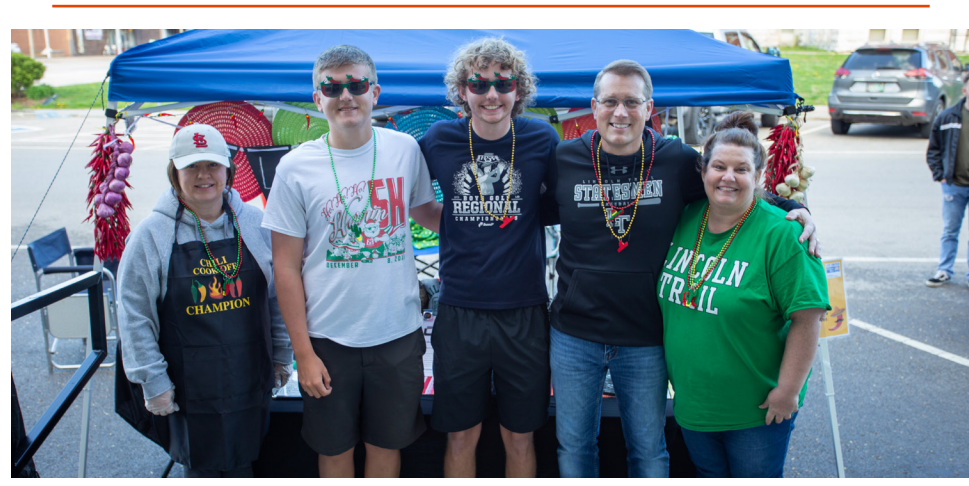
Lincoln Trail College participated in the United Way's 2021 Chili Cook-Off on April 10. The event helped raise more than $10,000 for the United Way of Crawford County.

game. She added 3.3 rebounds, 1.4 assists, and 0.8 steals per game.