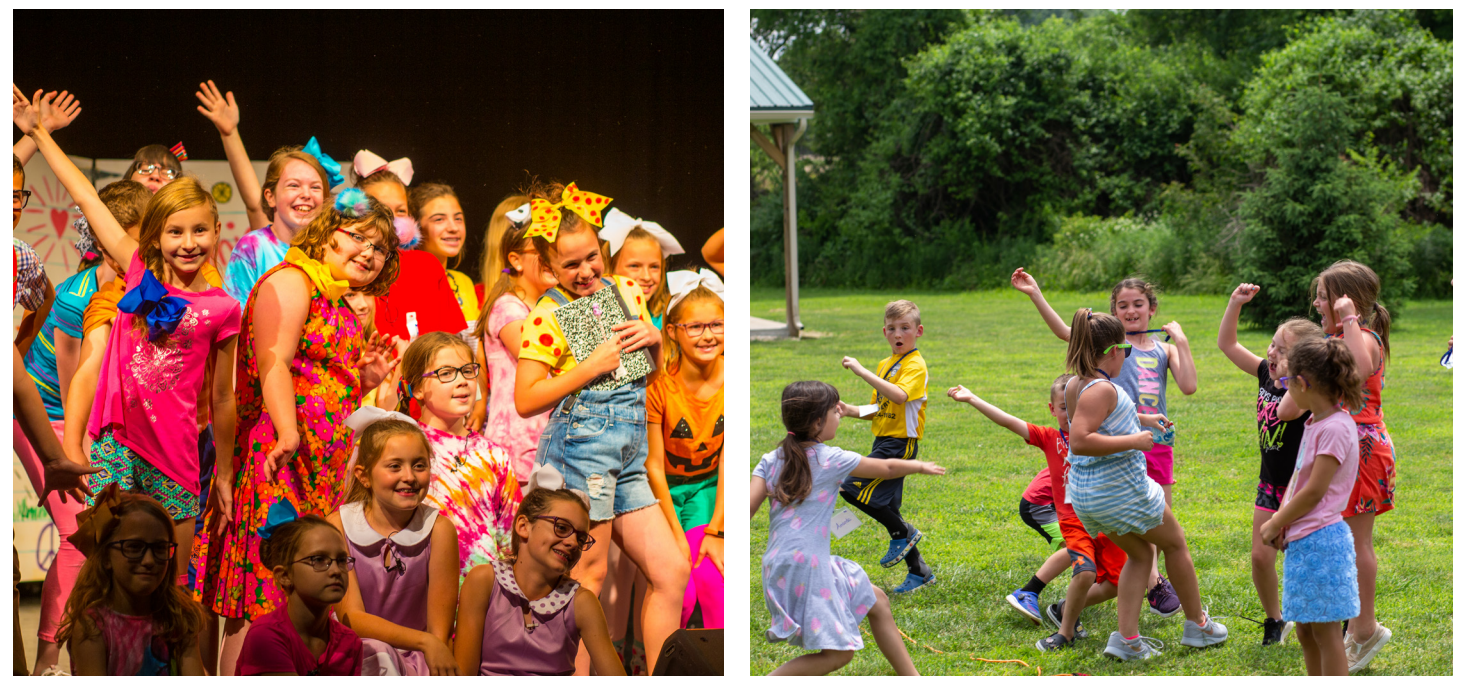
Lincoln Trail College will offer a variety of community education classes over the summer, including a return of the popular Children's Summer Theater and College For Kids programs.

"We weren't able to offer these programs last year because of the COVID-19 pandemic," says Lincoln Trail College Coordinator of Marketing Chris Forde. "These are both very popular programs that bring more than 100 children to our campus each year. We also weren't able to offer other community education classes for adults and we're excited to bring those back too.