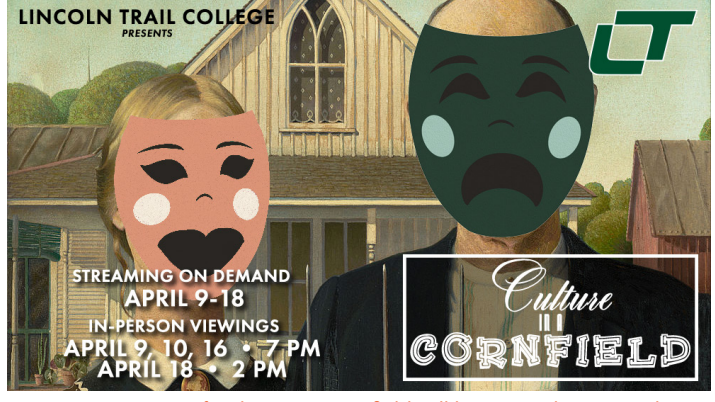
In-person viewings of Culture in a Cornfield will be on April 9, 10, and 16 at 7 p.m. and April 18 at 2 p.m. In-person viewings are available for a freewill donation. Streaming is $10.