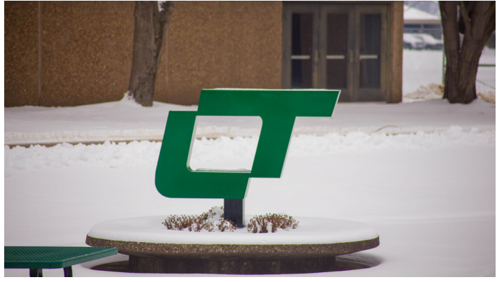
A February snow covers the campus of Lincoln Trail College.