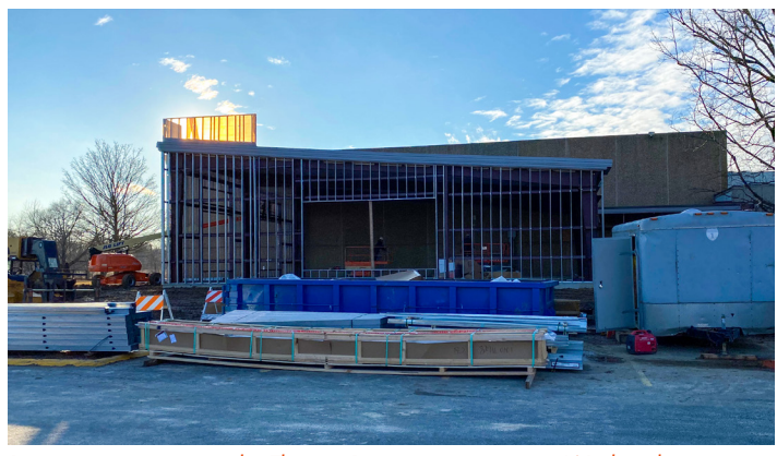
Progress continues on the Theater Renaissance project. Workers have started building the frame and the roof of the new addition to the Zwermann Arts Center.

The grant calls for 5.6 million dollars to be used for the construction of Lake Land's Manufacturing Technology Center and about 1.5 million dollars for IECC to use for teaching technology and equipment. Only nine community colleges (Illinois Eastern, John A. Logan, Kaskaskia, Lake Land, Lewis and Clark, Rend Lake, Shawnee, Southeastern, and Southwestern) in the Southern Region were eligible to apply for the funding.