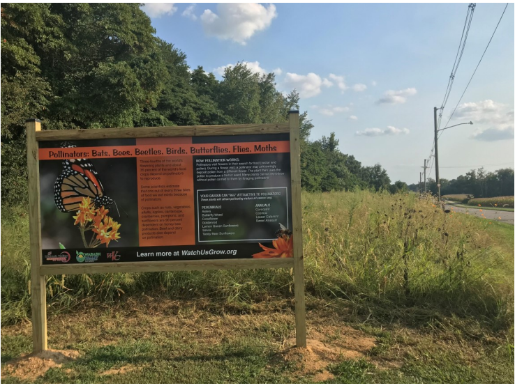
This large informational sign marks the site of the plot along Oak Street in Mt. Carmel, IL. Three-fourths of the world's flowering plants and about 35 percent of the world's food crops depend on pollinators to reproduce. Learn more at <a href="WatchUsGrow.org">WatchUsGrow.org</a>.

Various plants were sown on the pollinator field. Those plants in-