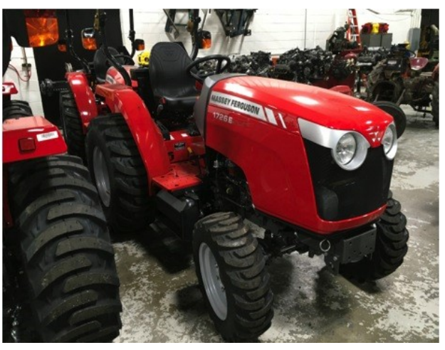
Pictured is one of the eight Massey Ferguson 1726E tractors purchased from Herschel Johnson Equipment in Albion, III.

The new tractors were purchased using funds from the grants the Diesel program received from IECC and the EDA "Through the recommendations of and help from the Diesel Technology Advisory Counsel nearly three years ago, the grant was awarded in 2019." According to the EDA's website, the grant was given as part of an Economic Adjustment a lifelong learner and a successful citi-Assistance grant in which $300,000 was given to IECC to fund upgrades to the workforce training facilities at three campus locations within the District.