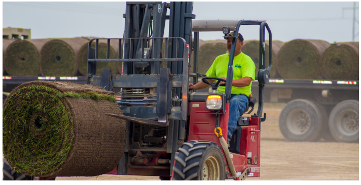
A worker transports sod for Statesmen Park.