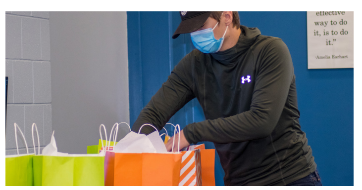
Student Senate makes care packages for students in quarantine. The packages were handed out with contactless delivery.