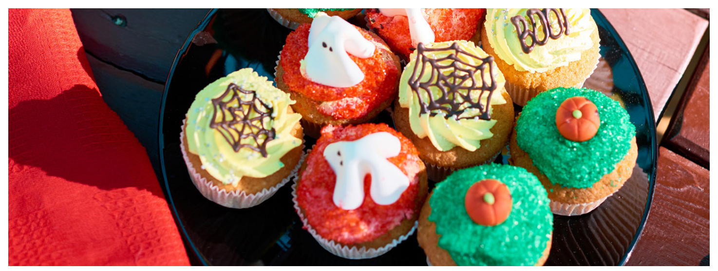
Community Education classes at Lincoln Trail College have resumed after pausing because of the COVID-19 pandemic.

The classes resumed September 3 with a webinar with the University of Illinois Extension about inflammation and arthritis. The webinar gave people the chance to learn about the three most common types of arthritis and how certain lifestyle choices can help prevent, relieve, and manage symptoms.