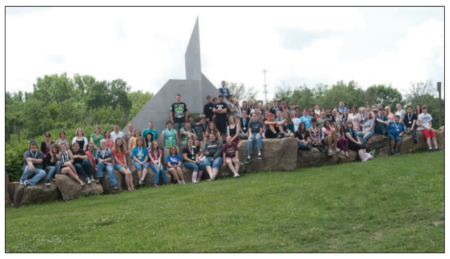
Illinois Eastern Community Colleges TRIO Upward Bound is celebrating 25 years of service. Pictured are the TRIO Upward Bound staff and students.