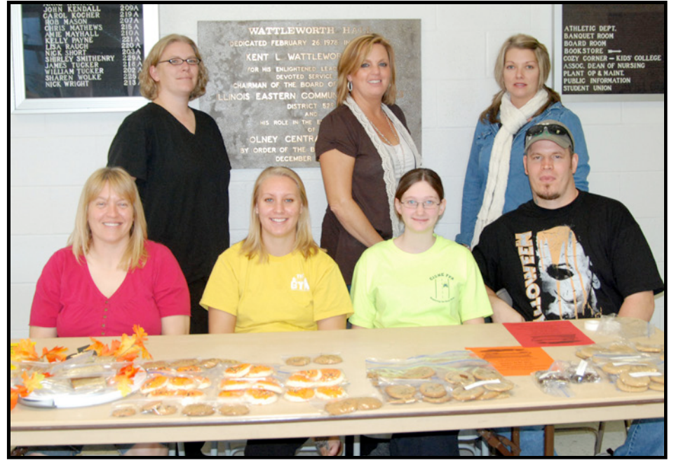
The OCC Massage Therapy Club held a bake sale at the college as the members celebrated National Massage Therapy Week Oct. 23-29. The students also held a cookout at the IGA in Olney.

According to the Journal of Bodywork and Movement Therapy, one 30-minute session of Thai Massage triggers an immediate 22percent reduction in anxiety and a 49-percent drop in muscle tension. The Thai Massage Technique is normally practiced while fully clothed