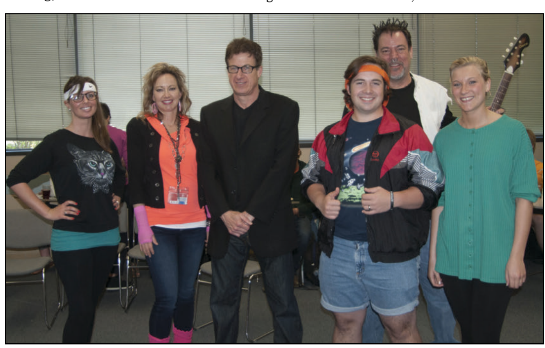
'The '80s in Words and Music'

The raffle will benefit the OCC Welding Technology Program, which will be donating 5 percent of the proceeds to the Olney Central College Foundation. The smoker includes a lifetime weld guarantee, under normal use.